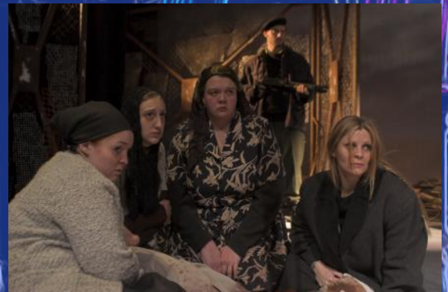
The Women of Troy