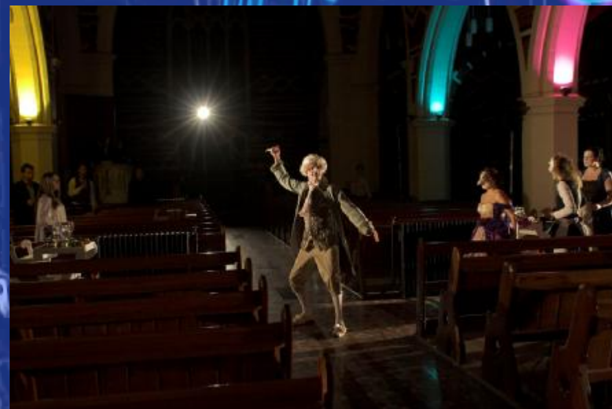
Prince Prospero in "The Masque of the Red Death"

My interest in lighting design began at The Hedley Walter High School in Brentwood, Essex where I was involved in lighting for school shows and went on to complete an A-level Drama and Theatre Studies course (following the design strand). After sixth form I successfully applied for the BA Theatre Design and Production course at Trinity College Carmarthen. I was attracted to this course in particular because it would give me an excellent grounding in the skills required for all aspects of theatrical production. During my first and second years at Trinity I completed modules in many areas of theatre including costume and scenic design, lighting and sound design, computer aided design, and written studies of various plays. Throughout this time my main interest has stayed with lighting design and production and wherever possible I have taken up opportunities to get involved in shows outside of the course including working as a student technician for shows coming into the Halliwell Theatre. Doing work within all areas of theatrical production has helped me to develop my skills as a lighting designer by showing me how collaboration between different production areas is essential in producing an excellent show.